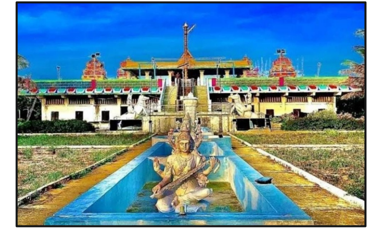
Balanagar Ayyappa Swamy Temple